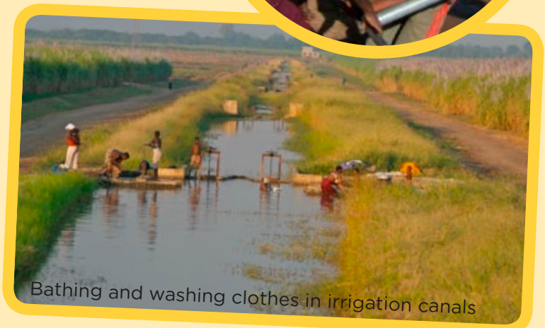
Bathing and washing clothes in irrigation canals